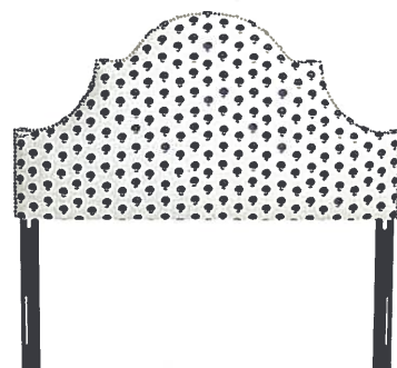
Hedren Headboard in Blue Dandelion, from $369; onekingslane.com

Channel the tailored look of our Gulf-front guest rooms (page 56) with upholstered headboards in sea glass shades.