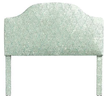
Camden Untufted Headboard in Belize Spa, $519 (as shown); ballarddesigns.com