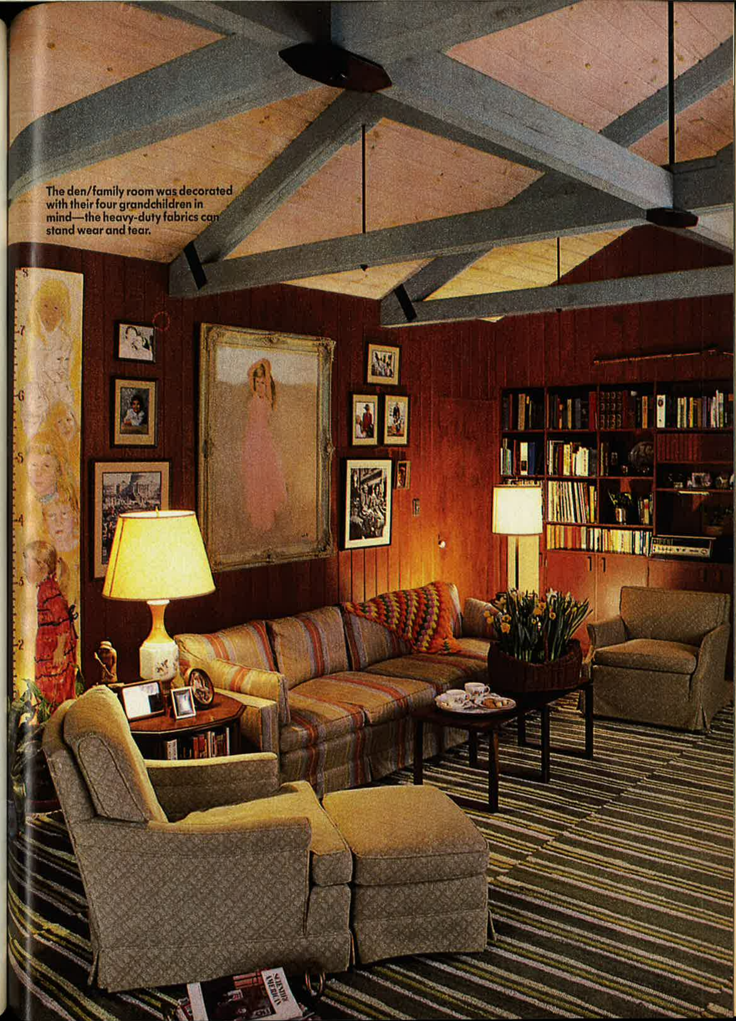
The den/family room was decorated with their four grandchildren in mind—the heavy-duty fabrics can stand wear and tear.