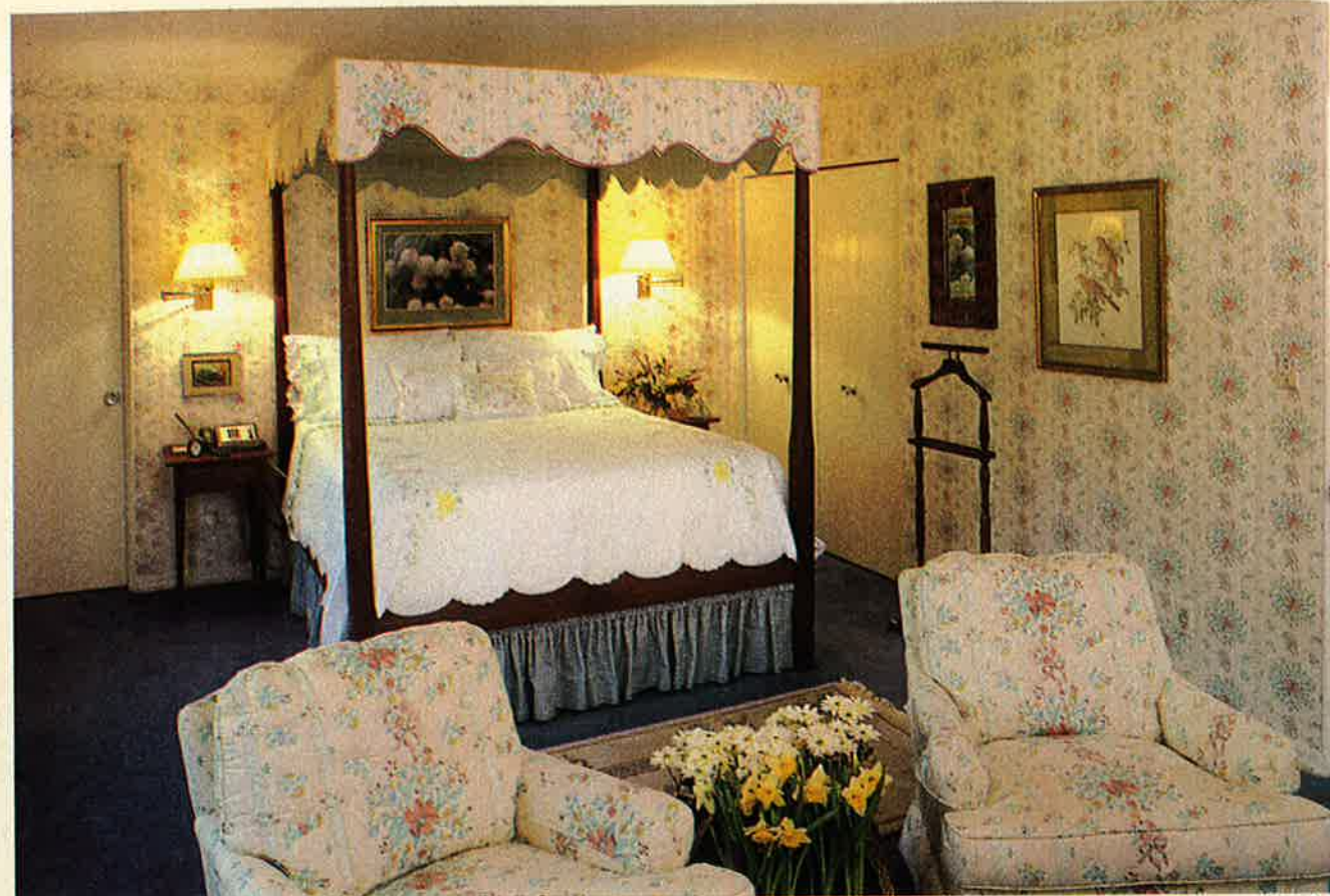
Since he left the White House, the former president has become interested in furniture-making. He crafted the bed